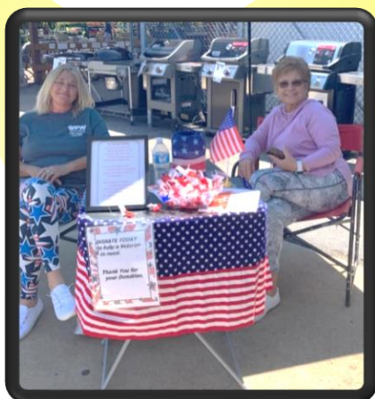
Members distributing "Buddy"® Poppies and collecting donations for their relief fund.