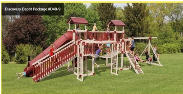
Proposed new playground