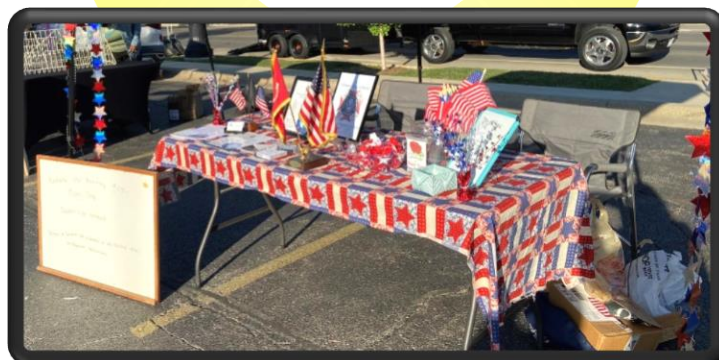
This booth was set up for Poppy Day at the Kankakee Farmer's Market.

Would YOUR Auxiliary like to be featured in "WARRIORS AT WORK"?